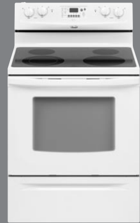
ELECTRIC RANGE RF362LXSQ: White-on-White