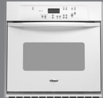
SINGLE OVEN RBS305PRQ: White-on-White