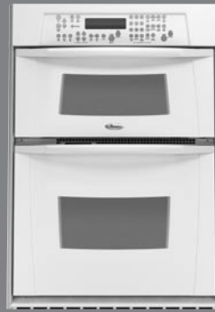
WHIRLPOOL GOLD® COMBO OVEN GMC305PRQ: White-on-White