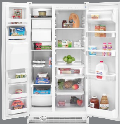
SIDE BY SIDE REFRIGERATOR ED5HBEXTQ: White-on-White