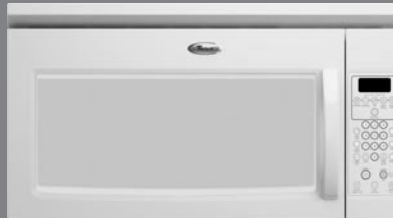
MICROWAVE HOOD COMBINATION MH1170XSQ: White-on-White