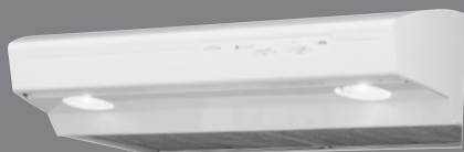
36" VENTED HOOD GZ5736XRQ: White-on-White