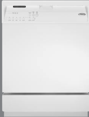
DISHWASHER DU915PWSQ: White-on-White