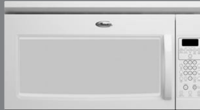
MICROWAVE HOOD COMBINATION MH1170XSQ: White-on-White