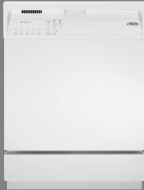
DISHWASHER DU915PWSQ: White-on-White