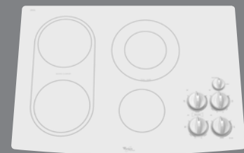
30" ELECTRIC COOKTOP GJC3034RP: Pure White