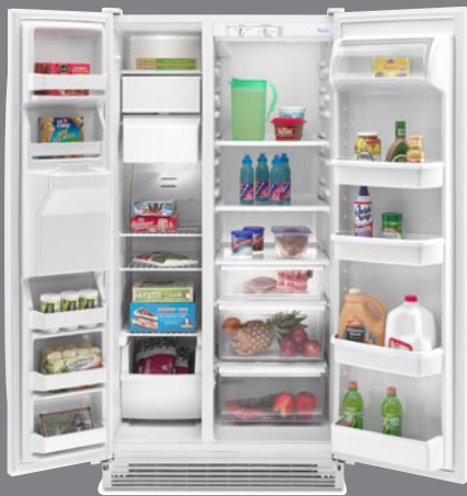
SIDE BY SIDE REFRIGERATOR ED2CHQXTQ: White