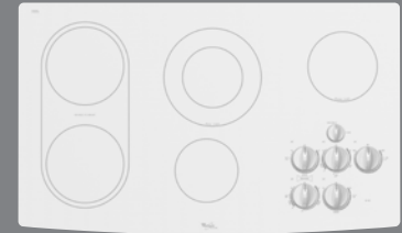
36" ELECTRIC COOKTOP GJC3634RP: Pure White