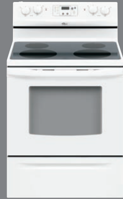
ELECTRIC RANGE RF262LXSQ: White-on-White